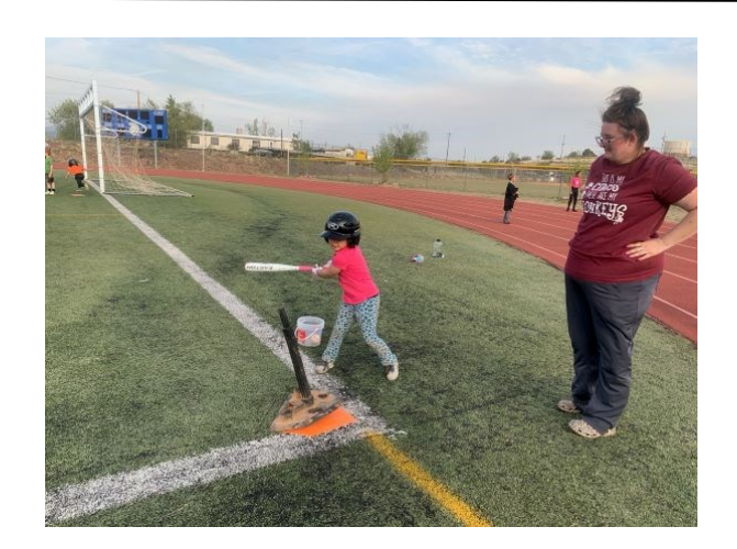
T-BALL PRACTICE 2022

ADOT will be sweeping Park and Lewis Aves. the first week in May. Your help is needed to do a good clean sweep. They can't sweep where vehicles are parked, so please remove all vehicles for this time frame. The gutters are full. Traffic lanes were painted on April 28th. Thanks!