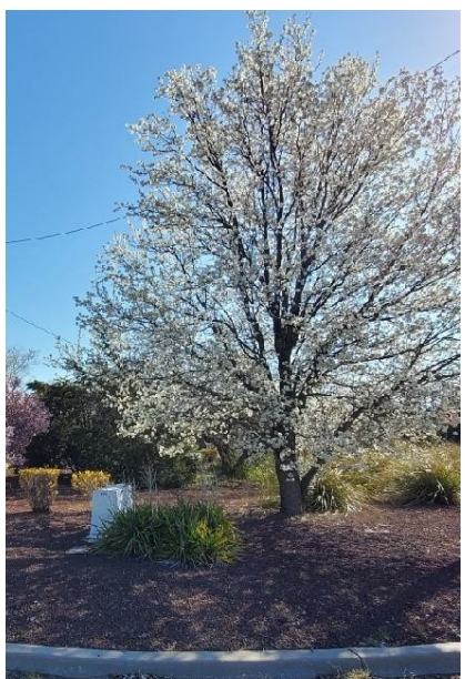
Top: Flowering Plum in front of Water Co.

Pictures of trees and shrubs in East Median