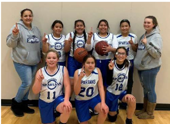
I-40 "B" Team Tournament Champions 2020