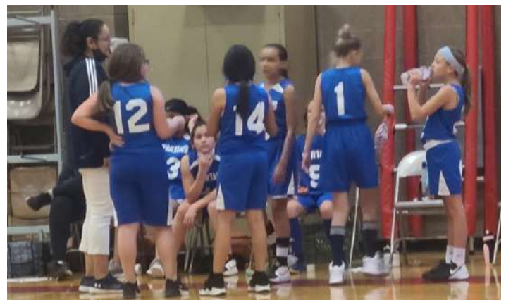
Ash Fork "C" Team vs Parks