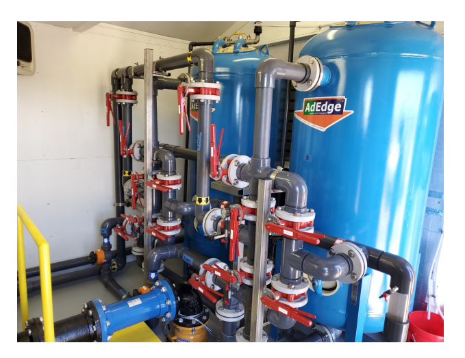
New Web Site Launched: ashforkwaterservice.com

Ash Fork Water utilizes this well and Treatment Plant to produce approximately 75% of our total water. Recent arsenic test show <7PPB arsenic level. 10PPB is the maximum allowable level in drinking water, Ash Fork Water must monitor the arsenic levels at this plant every quarter. The Running Annual Average of the last four quarters tested, (average of the four results) is how the level will be reported in the Consumer Confidence Report.