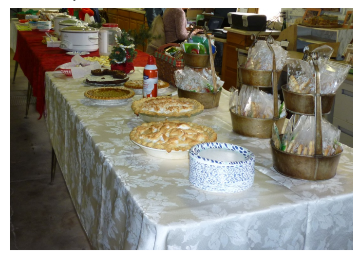
Volunteers will take a couple of weeks off for the holiday. From Dec, 29th to Jan. 2nd the Museum will be closed,

Lunch was served to all who came out for the event. For some it was their first time to visit as they are new to the area and some were our friends from Chino Valley Historical Society.